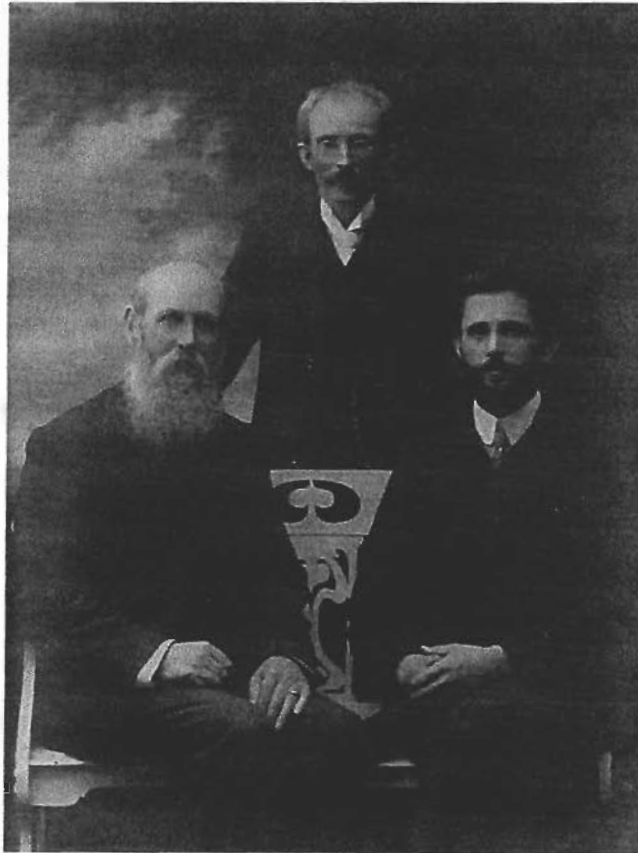
Clarke,McDermot & Daly