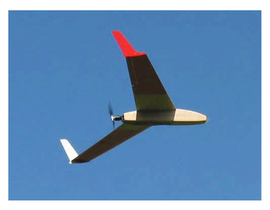
Figure 2: Duigan in Flight

Airframe: Foam/balsa with glass and carbon fibre skin Wingspan: 3m Wing Area: 90dm2 Airfoil: MH62 Mass Empty: 5.5 kg