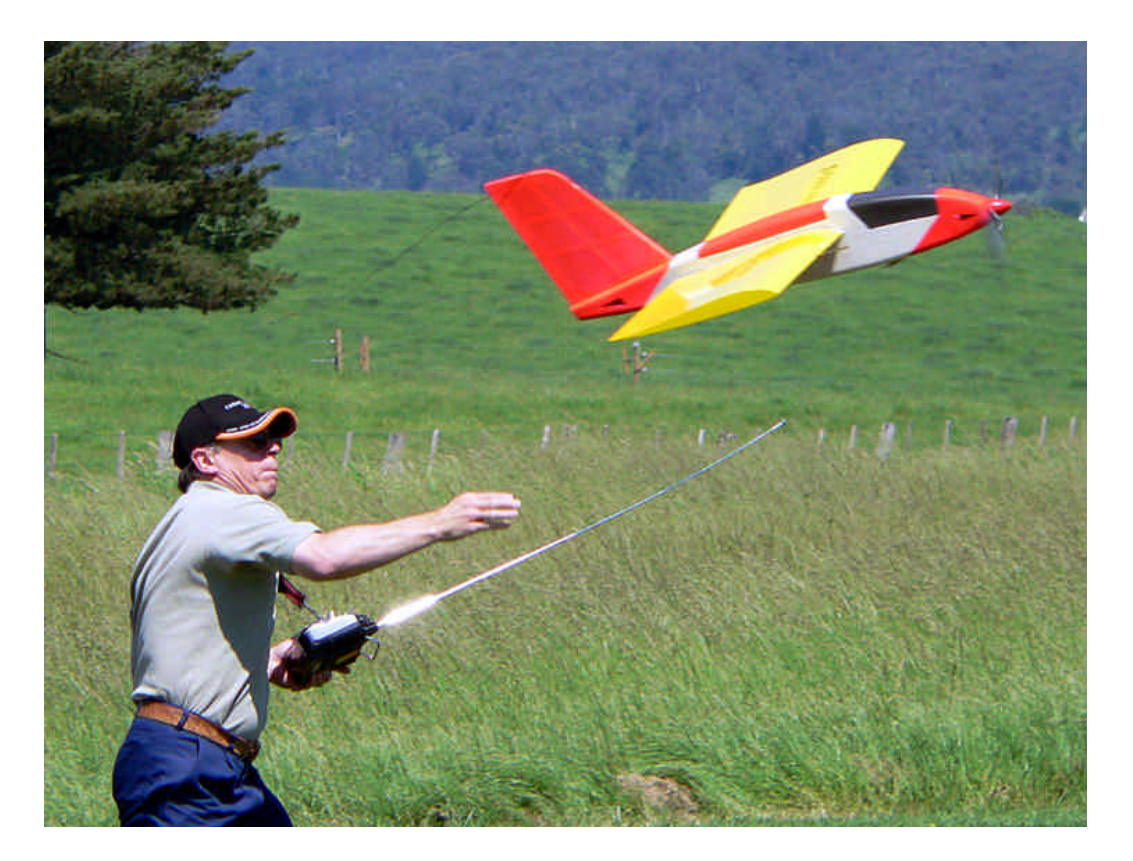
Figure 3: P15035

Specifications Span: 150 cm Chord: 35cm Length: 106 cm Wing Section: EMX07 Controls: Elevons Weight: 2.9 to 4.6 Kg - depends on motor battery and payload configuration Motor: Actro 40/6 - outrunner direct drive, 16 x 13 Aeronaut Cam Carbon Prop Motor Battery: 28 x GP3300 NiMh or 9 series x 4 parallel eTec 1200 LiPoly cells