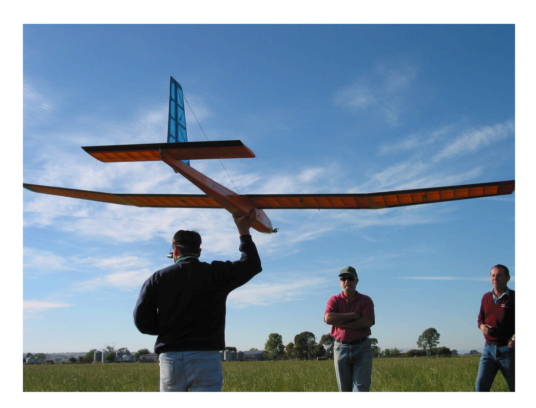
Figure 4: Big Bird before breaking the FAI World Altitude Record