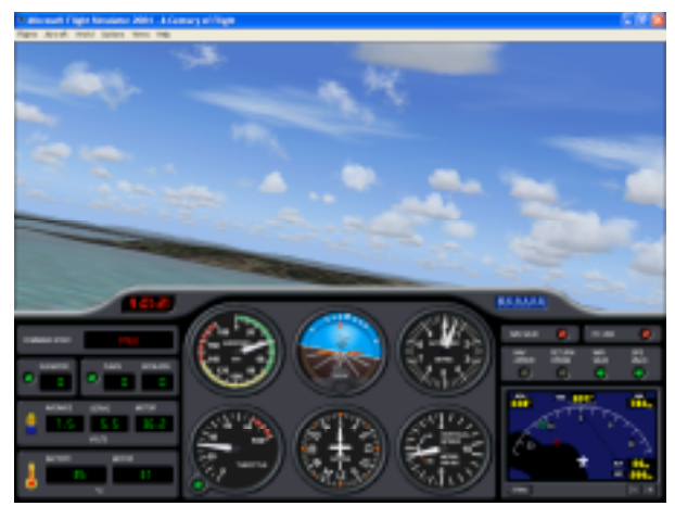
Figure 5. Graphical instrument panel for the UAV.

Microsoft Flight Simulator has traditionally used gauges programmed in C. However, in Flight Simulator 2002 a new kind of gauge was introduced, the XML gauge. Currently, in Flight Simulator 2004, both C gauges and XML gauges are supported, although the majority of the standard panels still use C gauges. The shift is however towards XML gauges and thus the panel for the UAV was built using XML gauges to increase the chances that it will be compatible with future versions of Microsoft Flight Simulator.