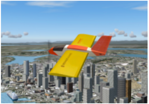
Figure 4. 3D graphical model of the UAV whilst in flight.

To overcome this problem the scale of the model was increased to have a wingspan of about 5 meters, which resulted in the model displaying correctly. It was not important to have the model at the correct scale, as it is simply a visual of the aircraft's position and orientation during flight.